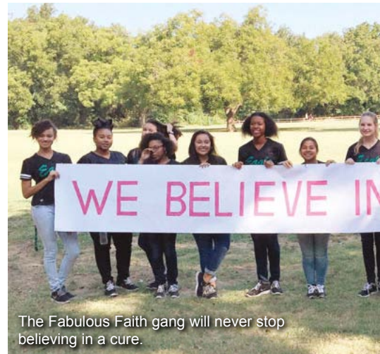
The Fabulous Faith gang will never stop believing in a cure.